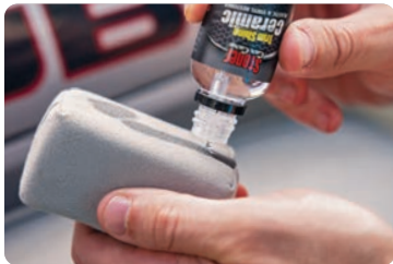
Pour a moderate amount directly on the applicator

Now it's time to coat your trim. Different plastics will vary in their materials, texture, and consistency. For example, rougher trim can be a little more "thirsty," but do not oversaturate it. A little bit goes a long way. Over application could produce unsightly puddling, pooling, and drips.