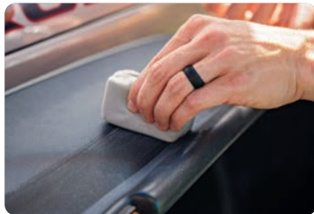
Gently and evenly apply to plastic and vinyl trim

The trim should not get wet for 2 to 4 hours after coating to facilitate even curing. Rain, dew, or water spray can cause an unsightly, uneven coating.