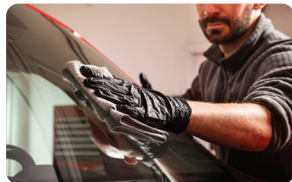
Dry buff in circular motions with the gray cloth

B. The gray microfiber cloth (included), will be your dry buffing cloth. Use it to remove the remaining 5% of excess product by buffing in a circular motion until the glass is perfectly smooth. It is important not to mix up your wet and dry cloths because this 2-cloth buffing process ensures an even coverage across the glass. Dry buff until you no longer see the rainbow.