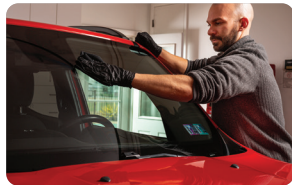
Wet buff in straight lines with the black cloth

With the black microfiber cloth (included), wipe in straight lines to remove 95% of the excess product. This will be your wet buffing cloth.